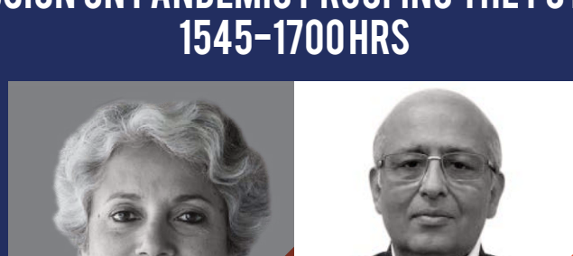
Dr Soumya Swaminathan Chief Scientist, WHO