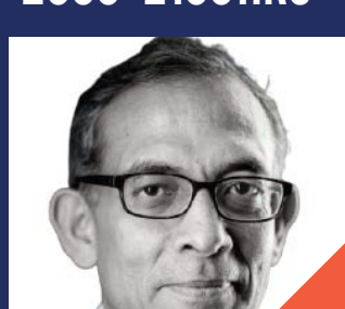
Nobel Laureate Dr Abhijit V Banerjee Ford Foundation International Professor of Economics Massachusetts Institute of Technology