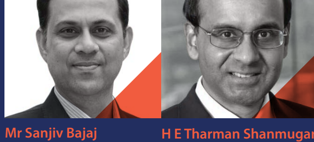
Mr Sanjiv Bajaj President-Designate CII and Chairman & Managing Director Bajaj Finserv Limited