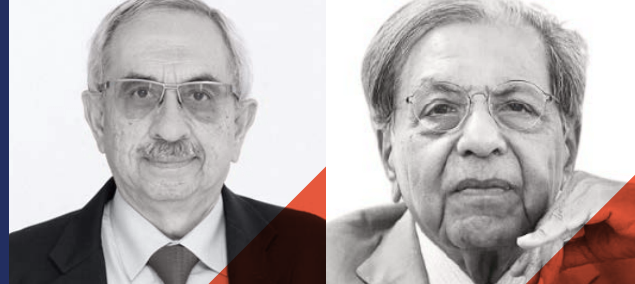
Mr Nadir Godrej Chairman & Managing Director Godrej Industries Ltd