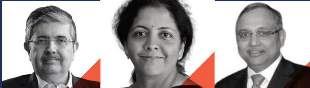
Mr Uday Kotak Past President, CII & Chairman, CII Global Economic Policy Summit