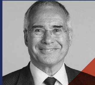
Prof Lord Nicholas Stern IG Patel Chair of Economics and Government and Chair, Grantham Research Institute, London School of Economics